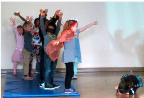
DANCE & MUSIC

Side x Side elementary school programs are designed to promote engagement, inclusion, equality, and achievement for all students. Elementary programs include the following: