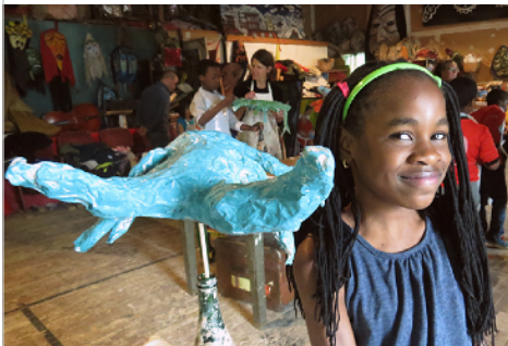
SCULPTURE & ILLUSTRATION